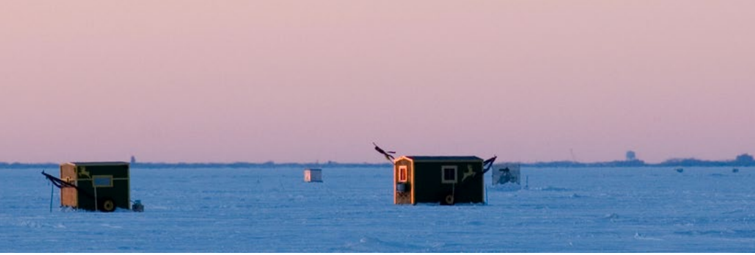
Ice shanties on Lake Winnebago.