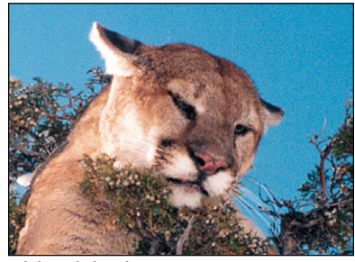
Adult male head