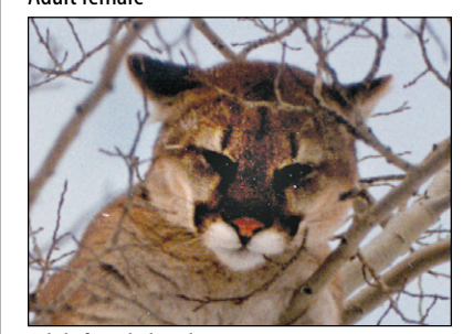
Adult female head